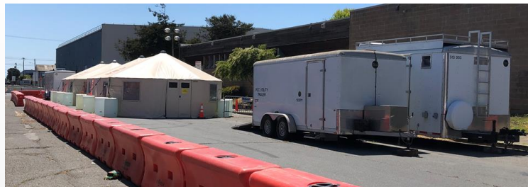
DPH Field Care Clinic at Southeast HC along Armstrong St: