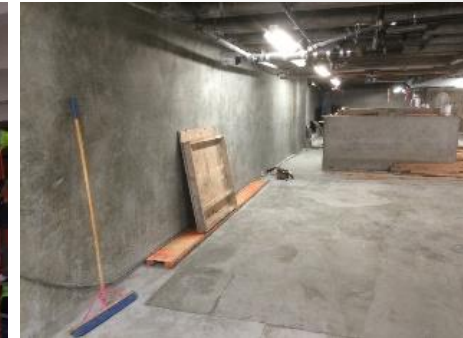
New shotcrete shear walls