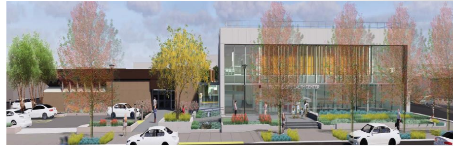
Southeast Health Center (existing)