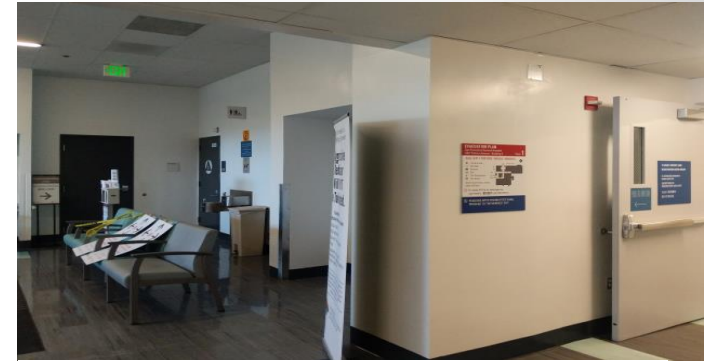
Completed wall and floor restoration near Urgent Care Clinic