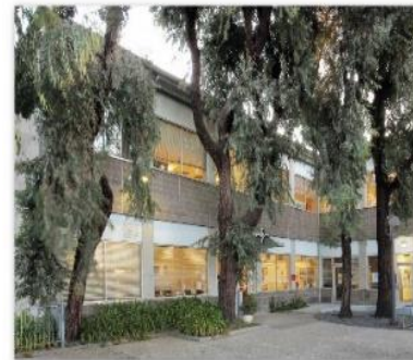
Castro Mission (existing)