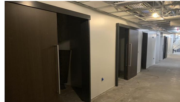
New door sliders installed