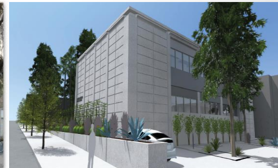
Castro Mission (rendering after renovation)