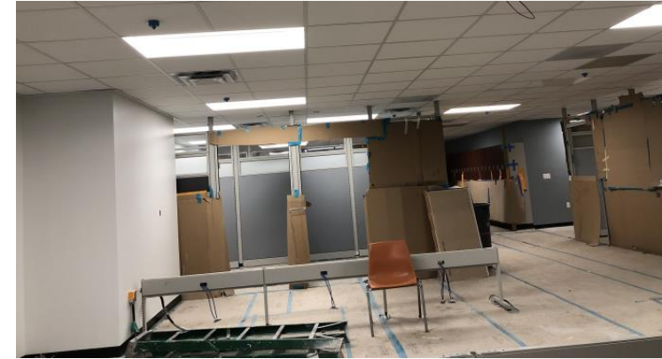
6H Surge – Furniture installation in progress